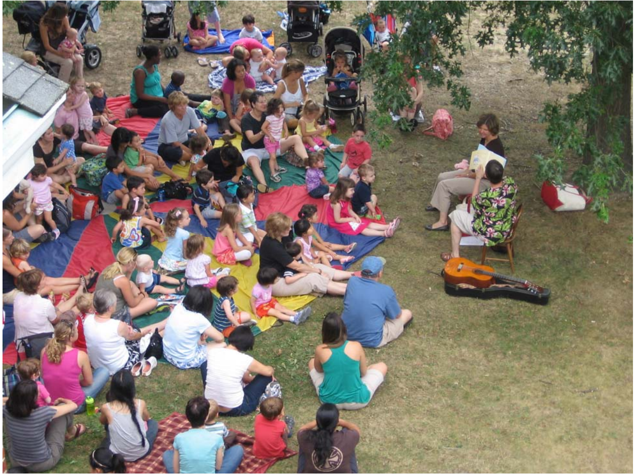
Bedford Public Library's Children's' Librarians lead a summer storytime on the lawn. (August 2010)